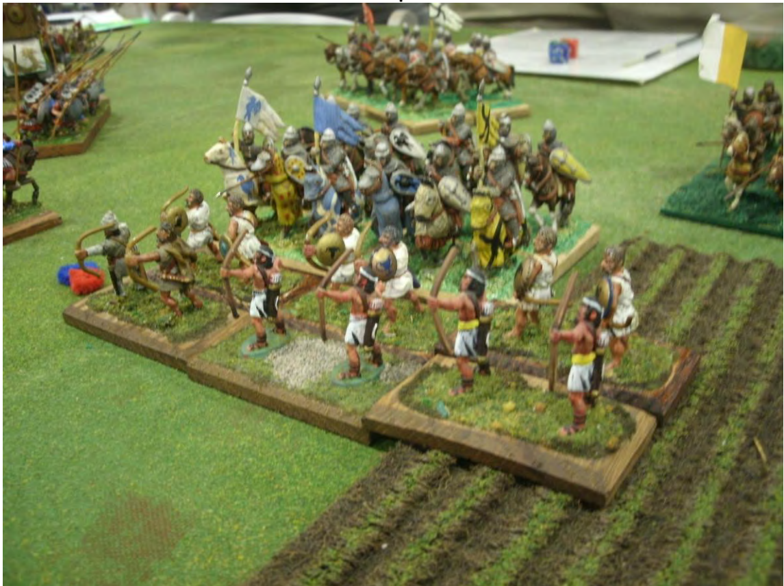
An Odd Mix