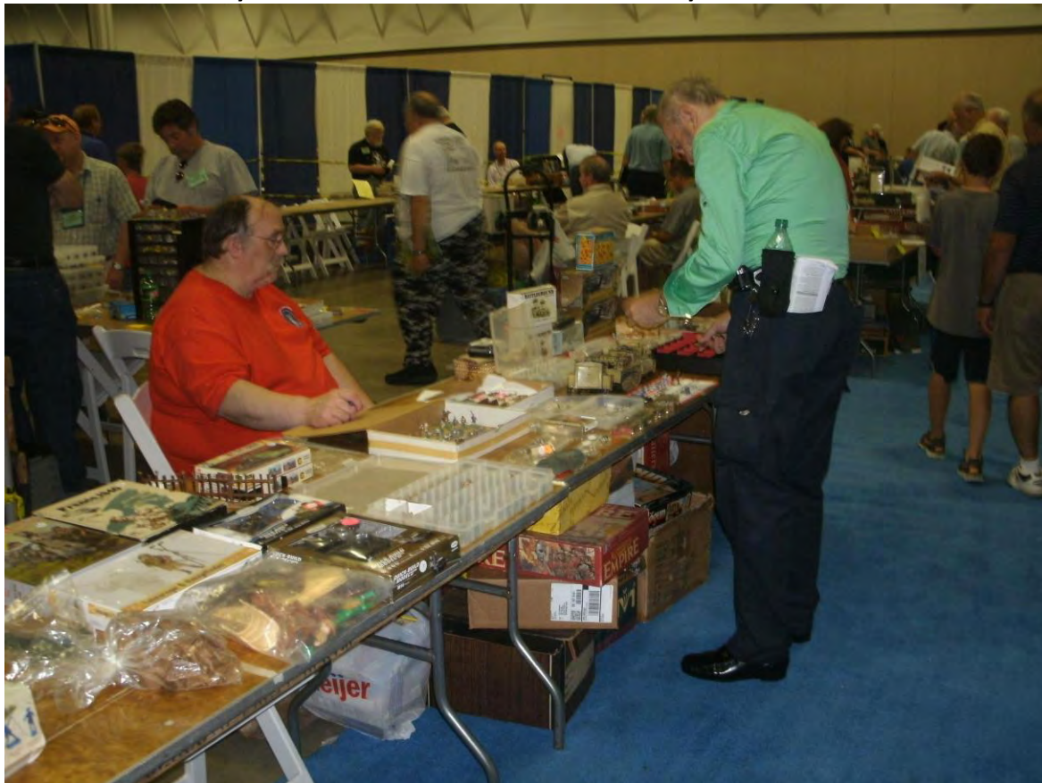
Still More Of Wally's Basement