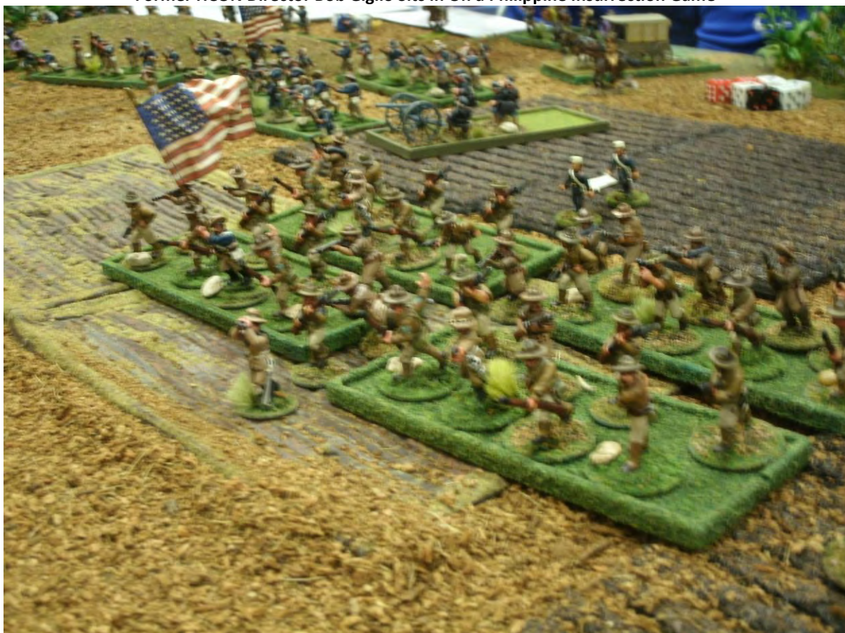
American Imperialists Advance