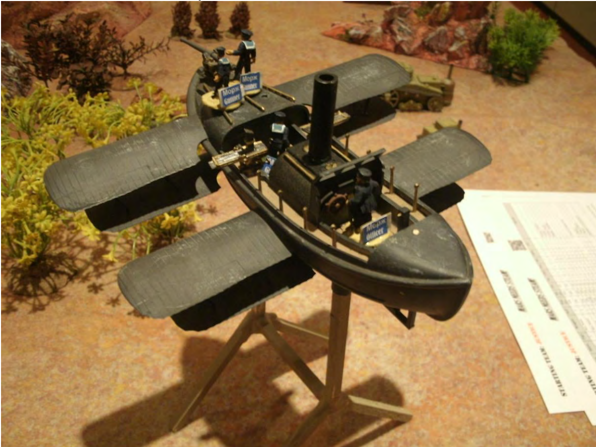
Overflowed By A Contemporary Airship