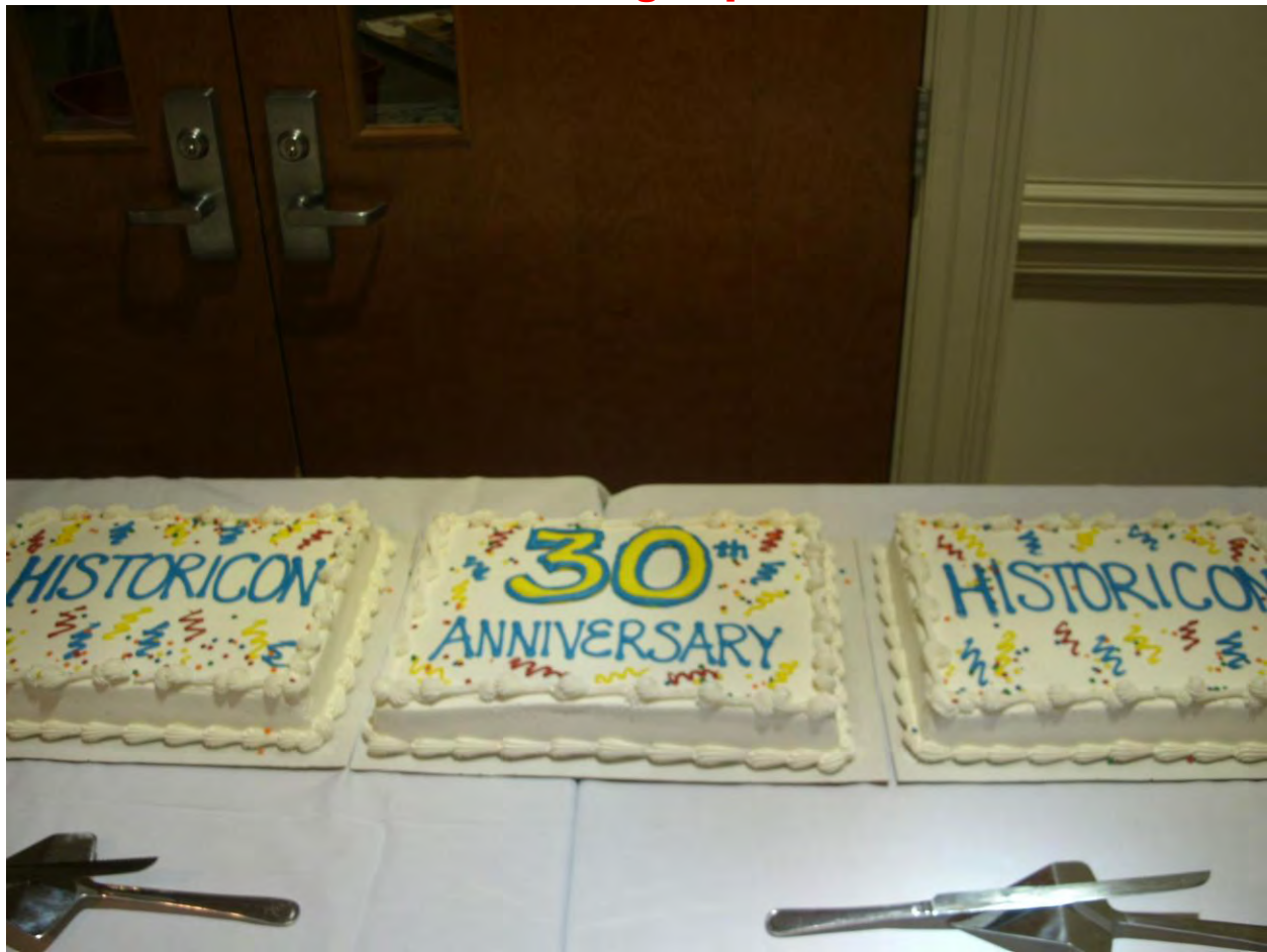
Anniversary Cake Served Saturday 19 July 2014

It was in April of 1984 that our negotiations with a major multi-genre convention (ATLANTICON) fizzled out. For the second time we had to scramble for a prime time convention. In 1983 it was NYCON-a small affair in Manhattan (a high rent district.) So we went ahead and started HISTORICON. The first one (July 1984) was held "The Bunker" an underground parking garage in the Maryland Suburbs of DC. But by 1987 having outgrown the "bunker" we moved to the Penn Harris in Camp Hill PA in 1987. By 1991 we had outgrown that facility as well, and moved onto the Lancaster Host in Lancaster PA. From there HISTORICON moved to the Valley Forge Convention Center for 2010 and 2011. And in 2012 we came to Fredericksburg VA.