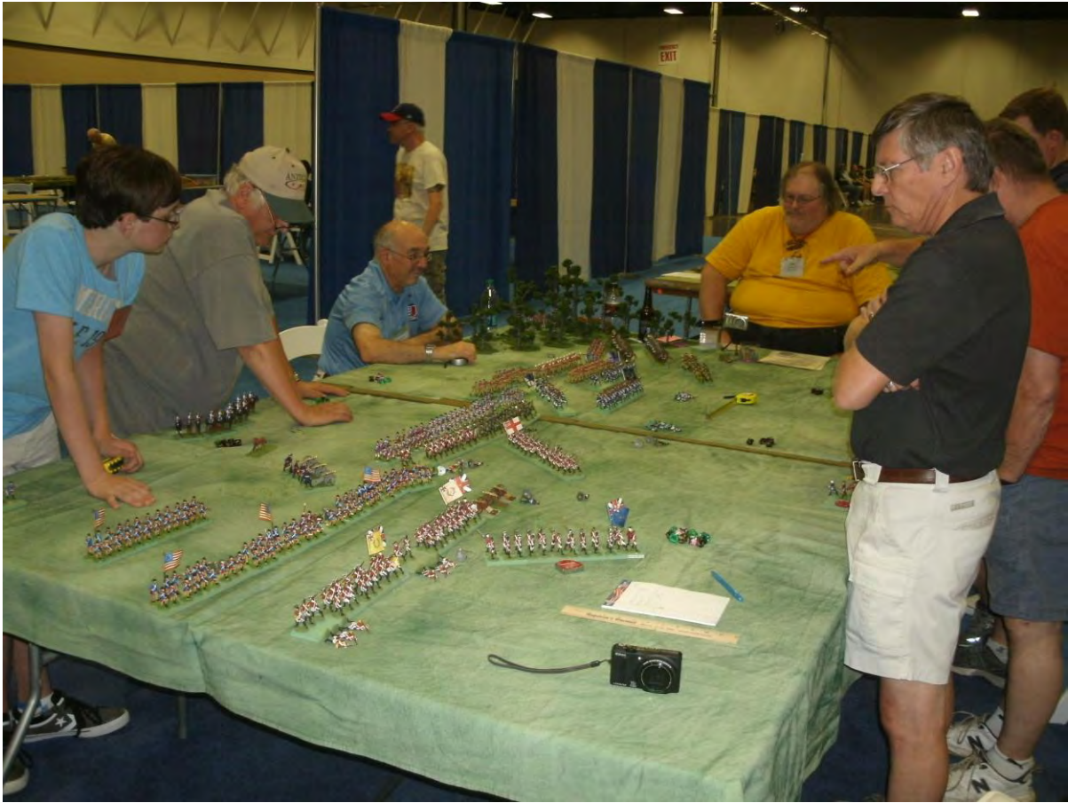
Usually 40mm Flats Are Imitation SYW By HAWKS.