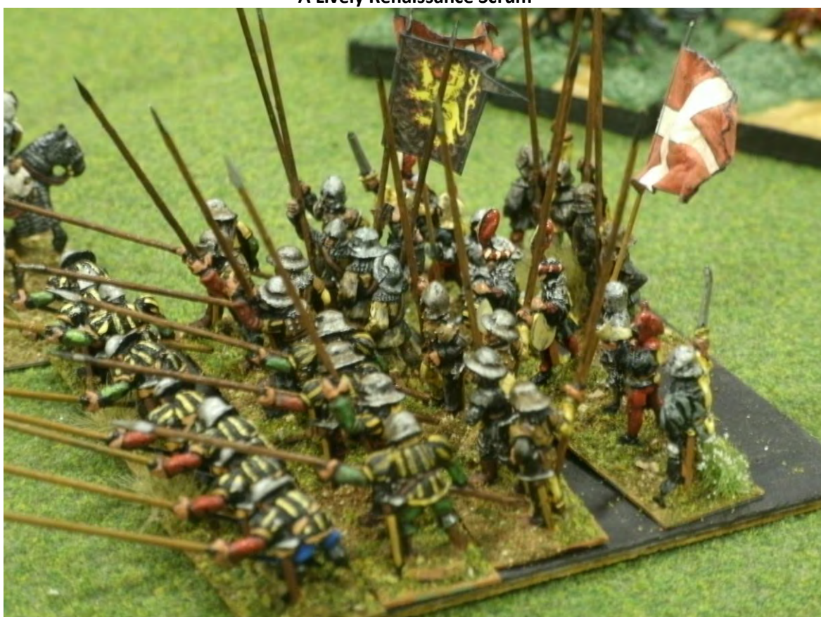
An Impressive Stand of Pike