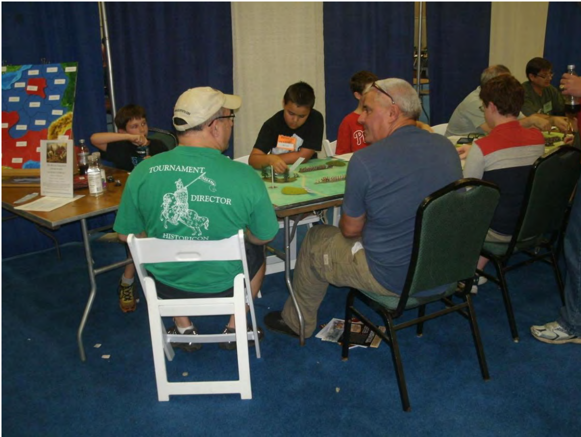
As Usual The Tournament Scene Included the DB Series