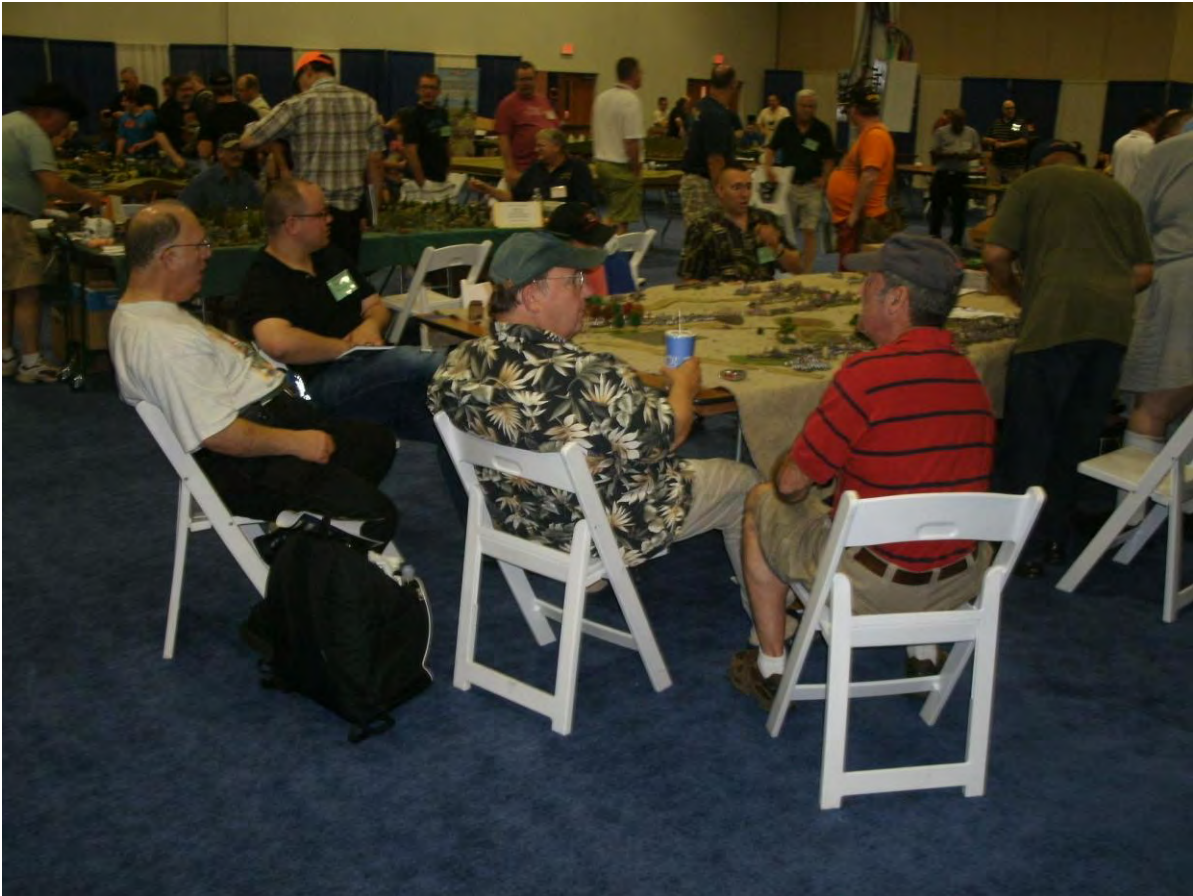
A Sizeable FOW Tournament or Two-But Not The National