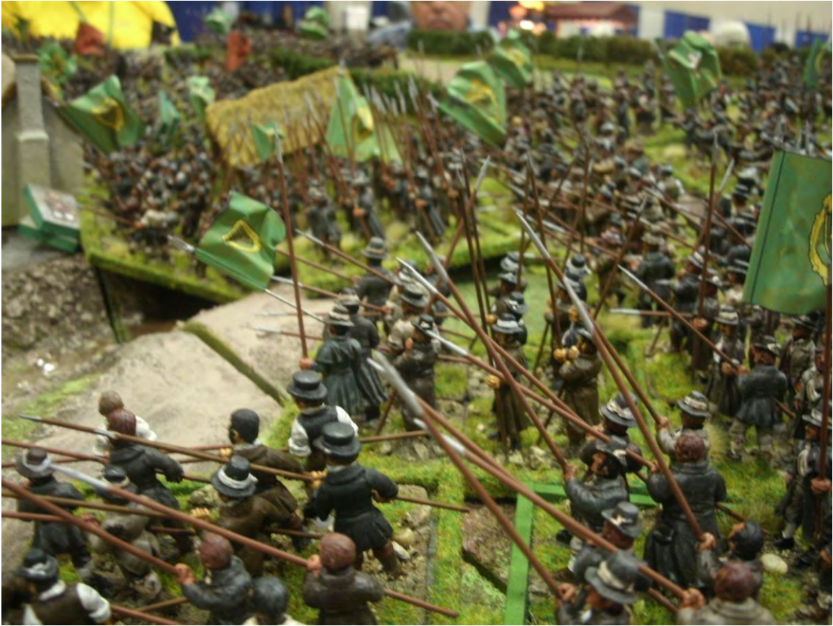
The Display Was Up Most Of The Convention-Don't Know How Many Times It Ran