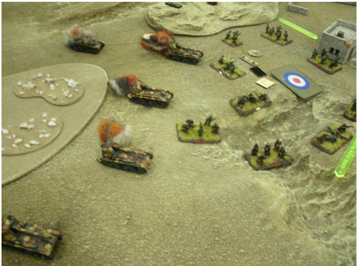
This Game Had More SP 90mm On An M13/40 Chassis Than Mussolini Ever Had