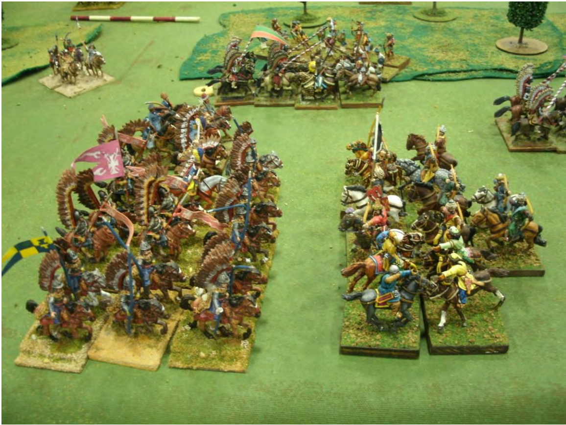
But Polish Winged Hussars Are a Crowd Favorite