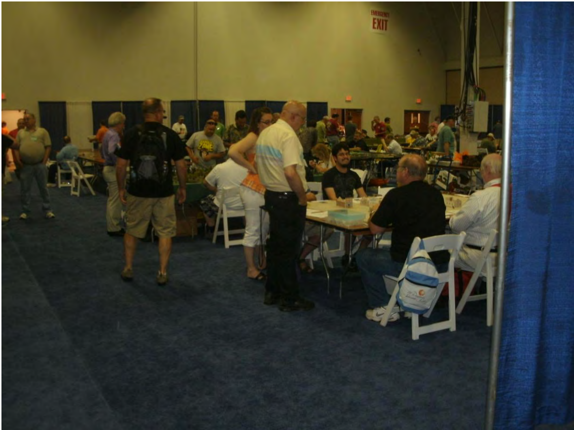
The Tournament Area (Mostly FOW Here) Filled Up Early