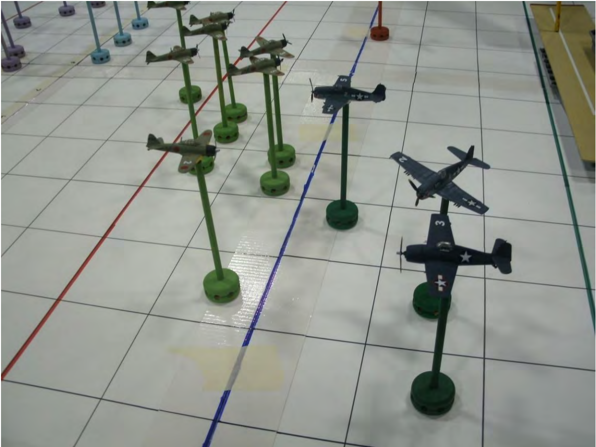
Zeroes and Hellcats Mix It Up-Above Large Planes Attack Tiny Ships