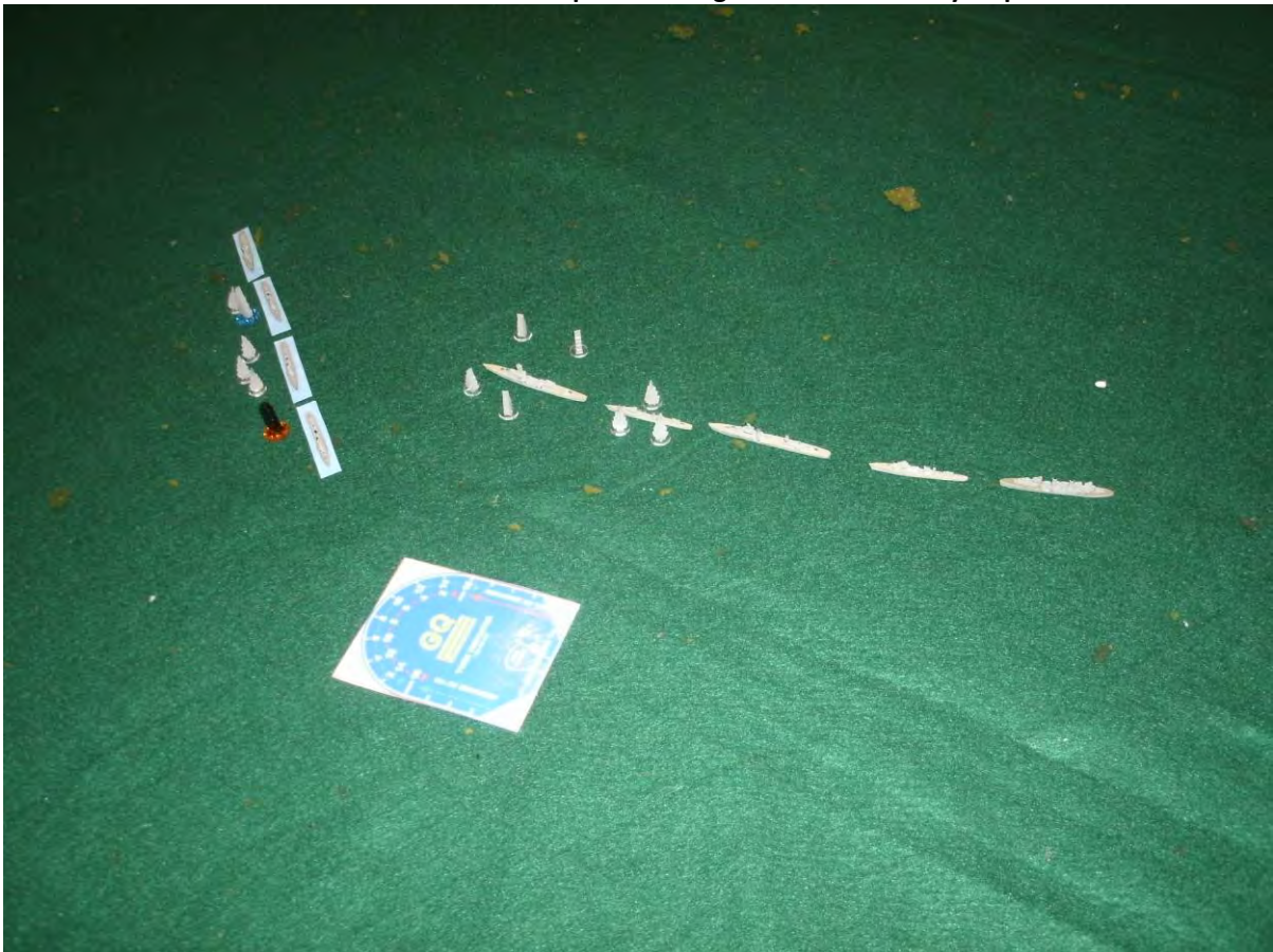
Modern Ships Tend To Be Small