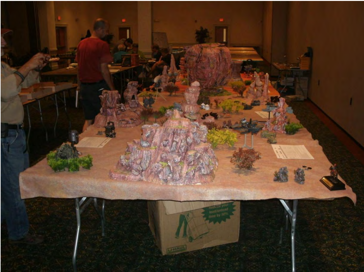
Not Exactly Historical-Frank Chadwick's Mars As Of 1889