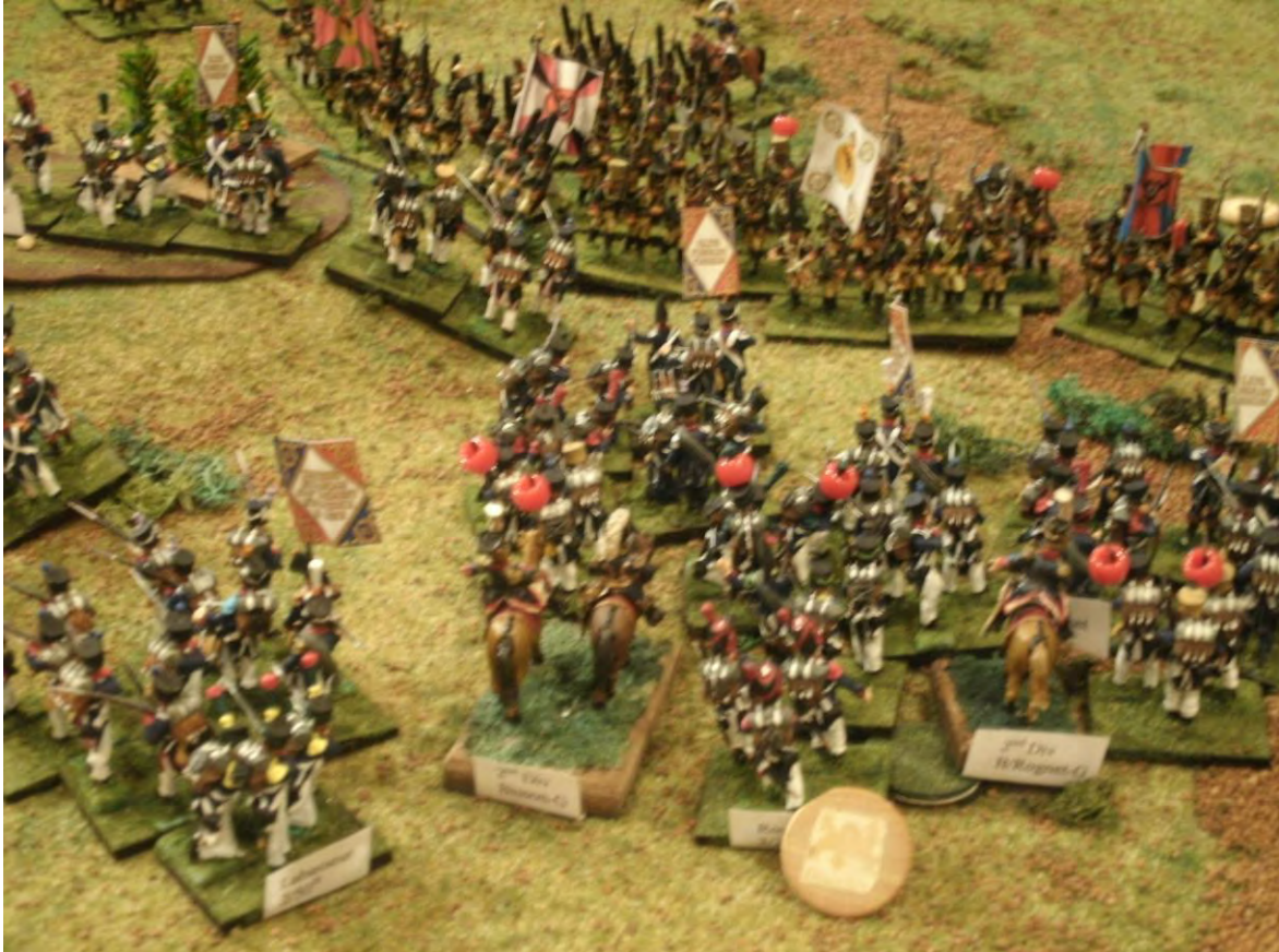
Napoleonics Were Well Represented- These 28mm Offerings Appeared Thursday