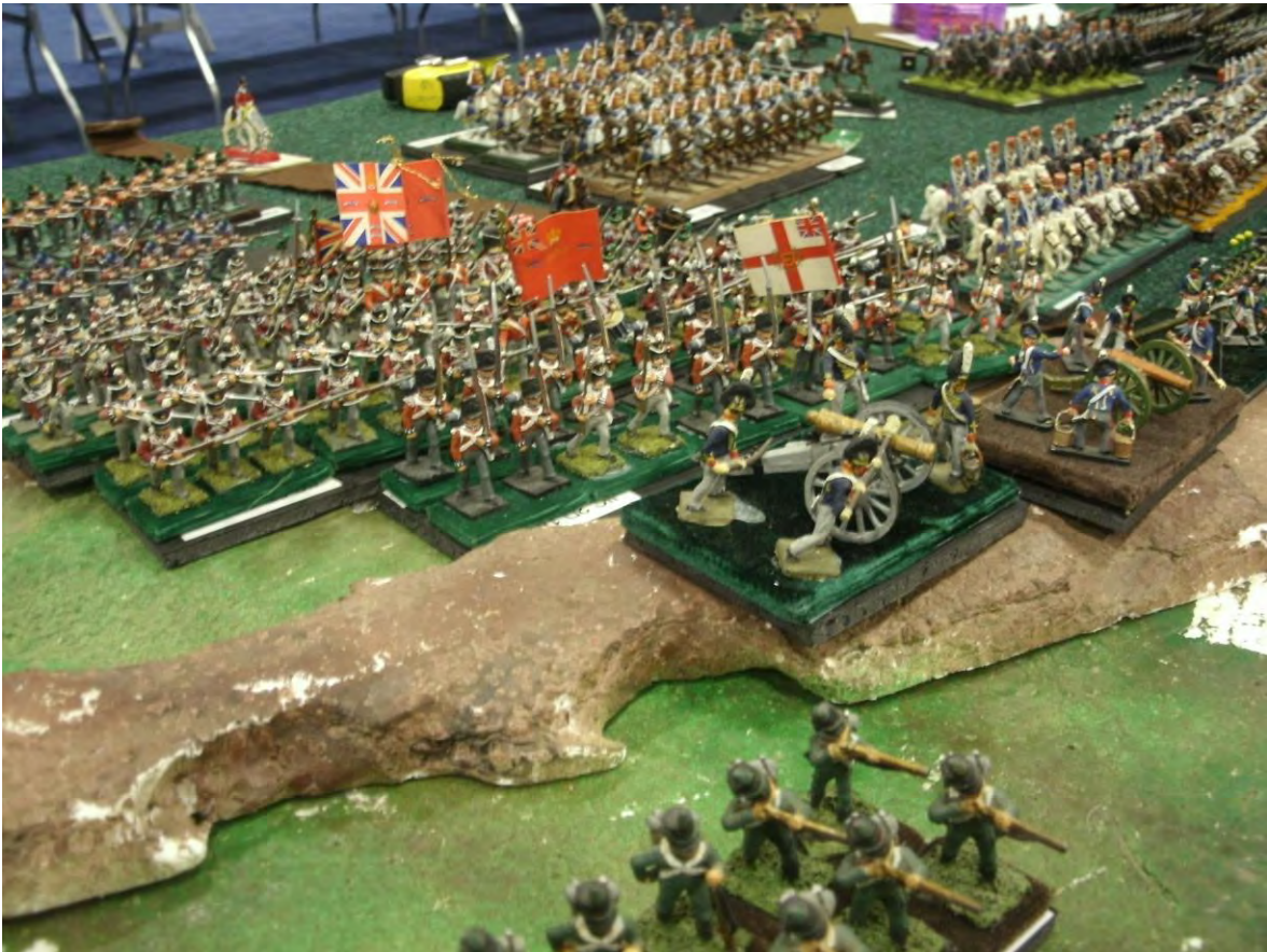
There Was Even A Napoleonic Mini Campaign Which Increased The Representation