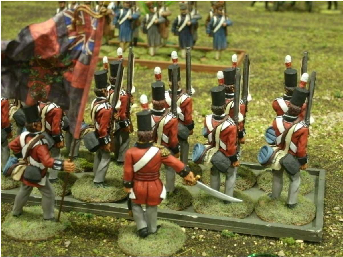
More Napoleonic Action-And High Quality As Well