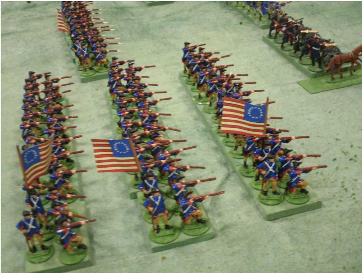
American Rebels Advance Thursday Evening