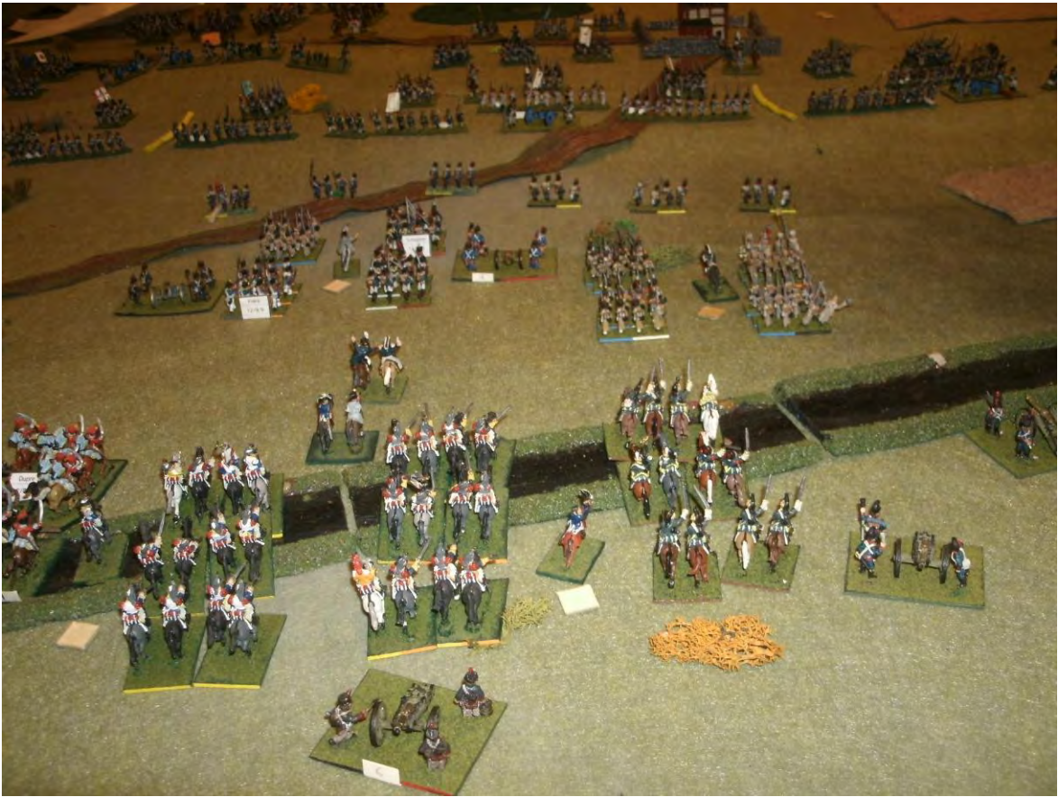
As Did These Smaller Versions