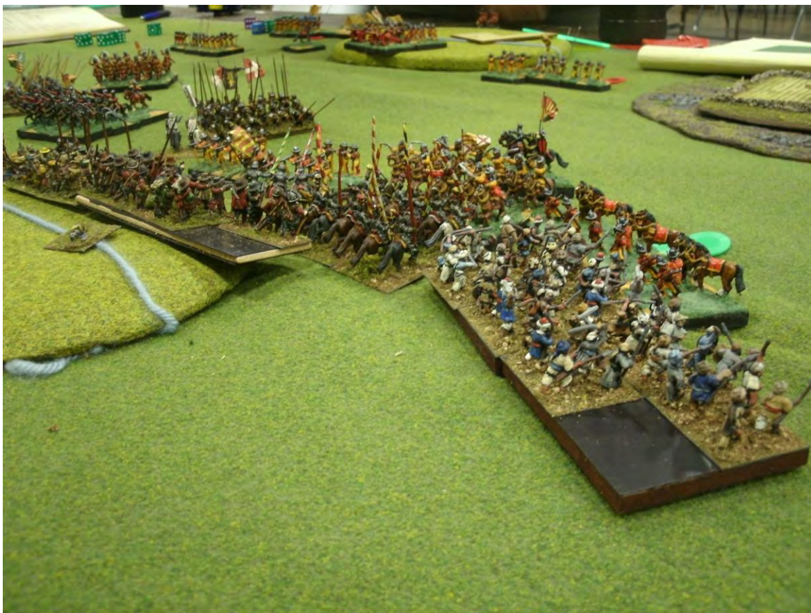
A Lively Renaissance Scrum