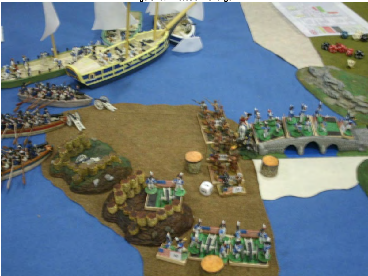
Some Are Big Enough To Actually Be Seen