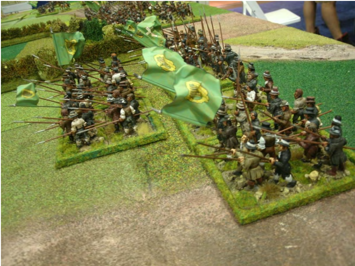
Sponsored By WARGAMES ILLUSTRATED-Napoleonic Brits Versus Irish Pikes