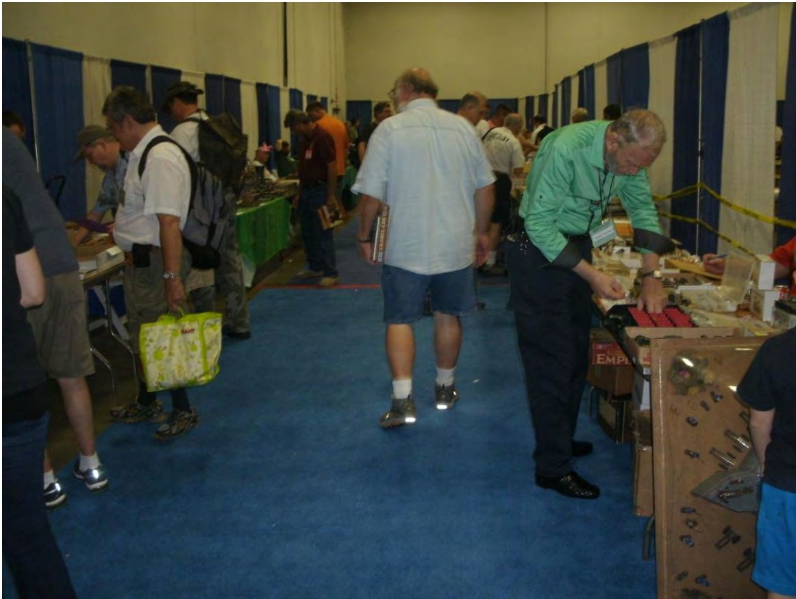
"Wally's Basement" AKA The Flea Market Always Draws a Crowd