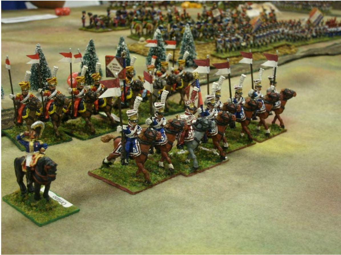
First (Polish) And Second (Dutch) Lancers of the Imperial Guard