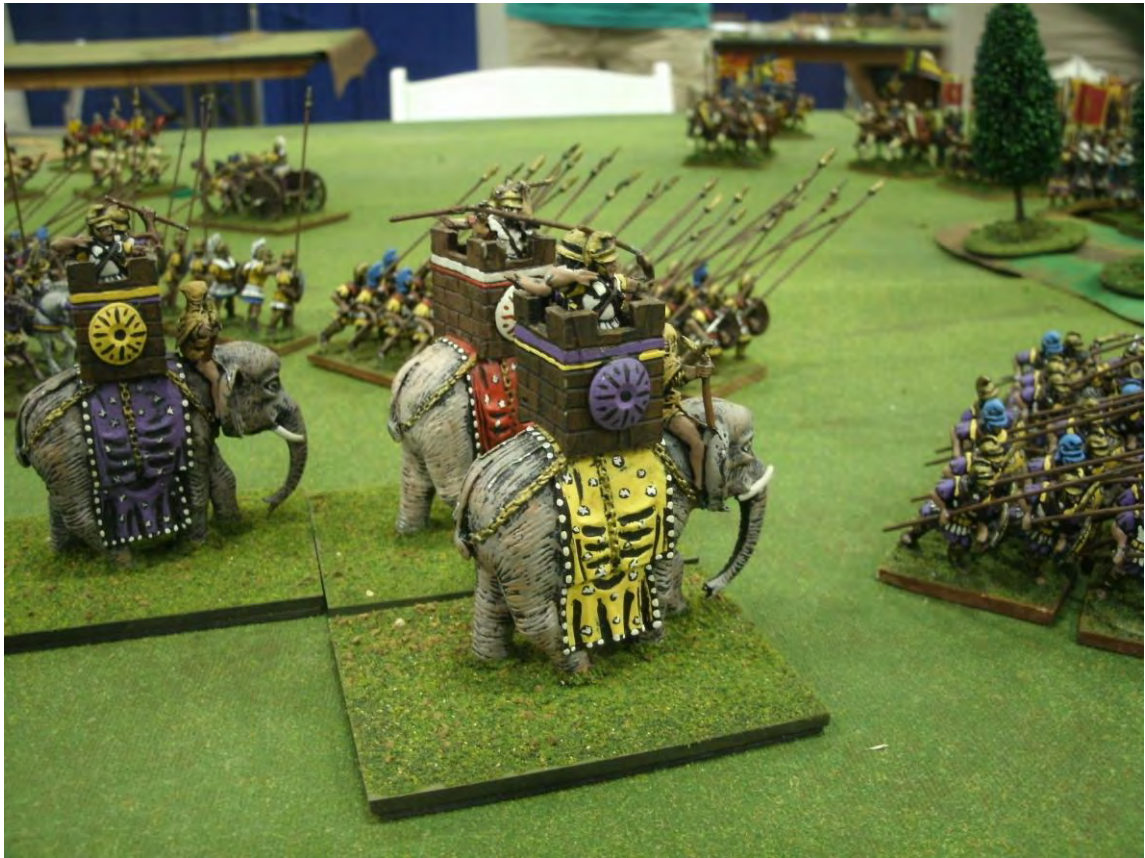
But Ancient And Later Periods Were Well Represented In Tournament And Stand Alone