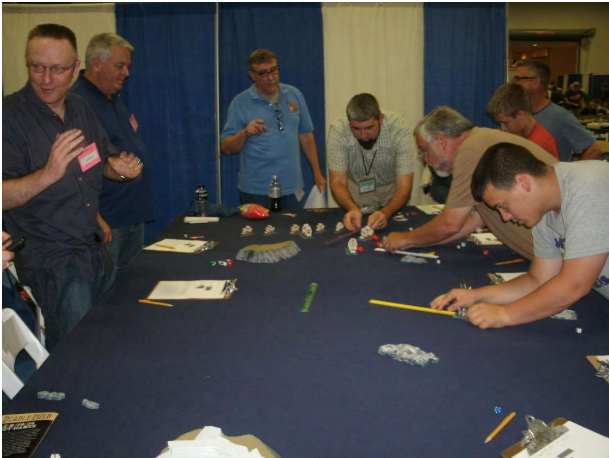
Age Of Sail Vessels Are Larger