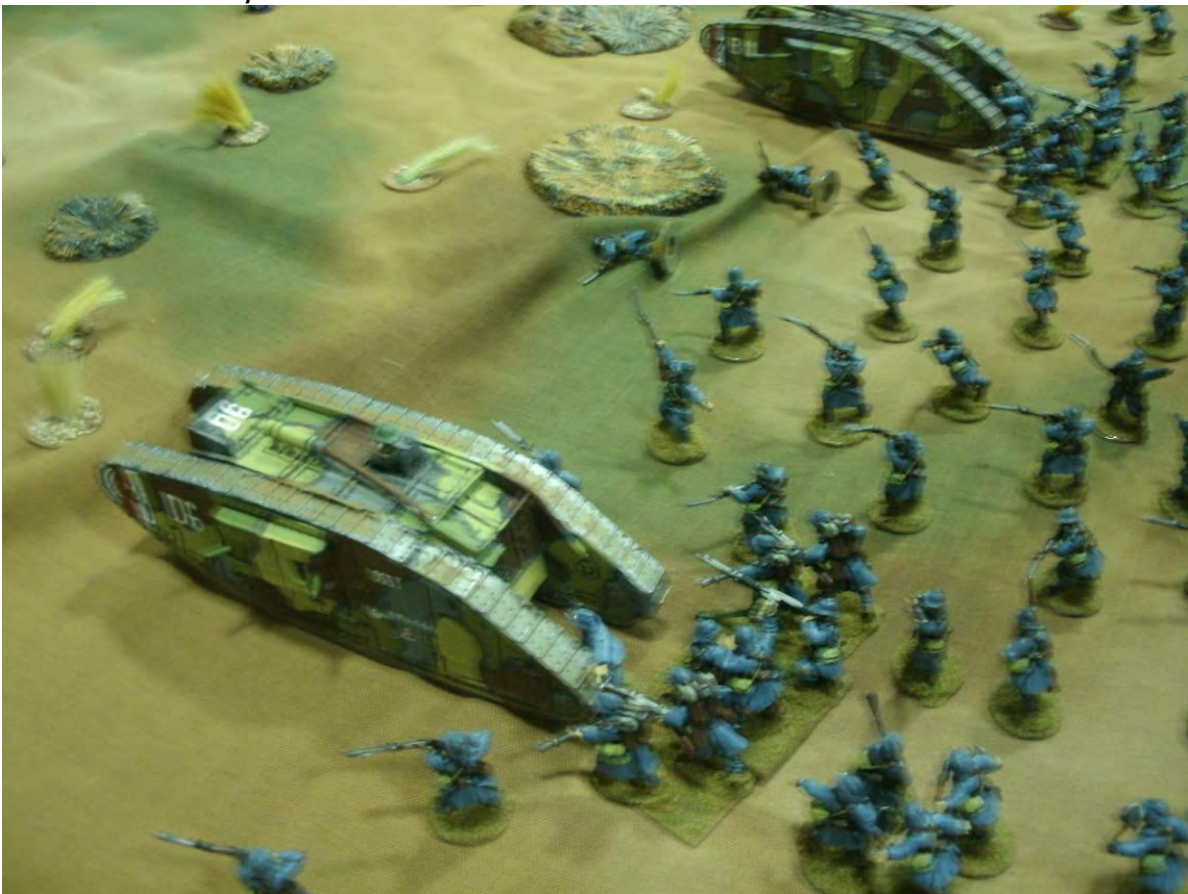
Only Token Attention Was Paid To The 100 th Anniversary Of The Start Of The Great War-I've Seen Genuine 1914 Games In The Past-This Looks Like 1917 With The Wrong Tanks