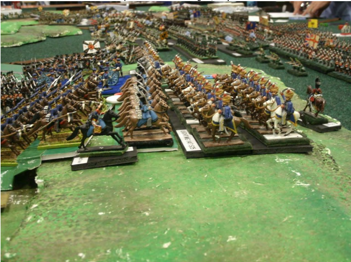
A More Classic Macro Napoleonic Game