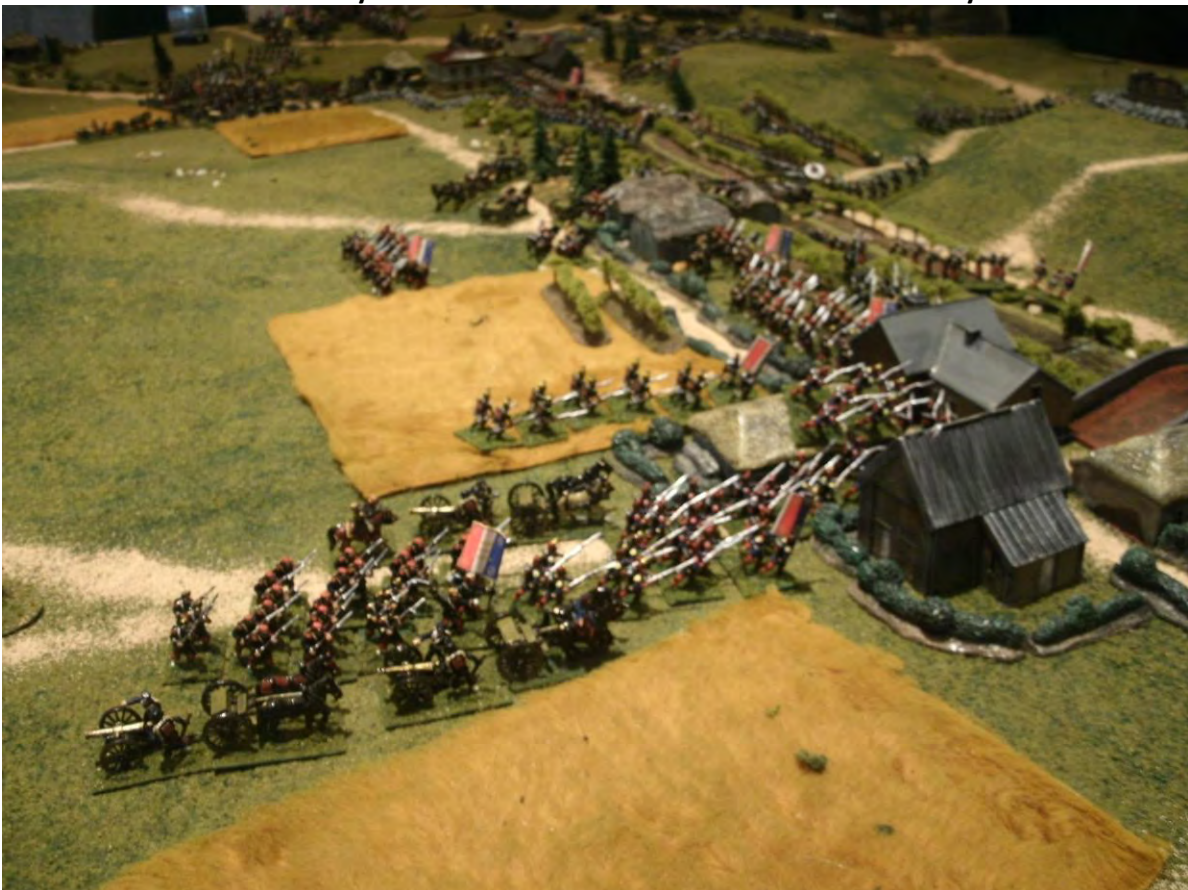
From 1700 To The Russo Japanese War-But The Crimea Is A Good Fit-The Most Recent European War Before the American Civil War