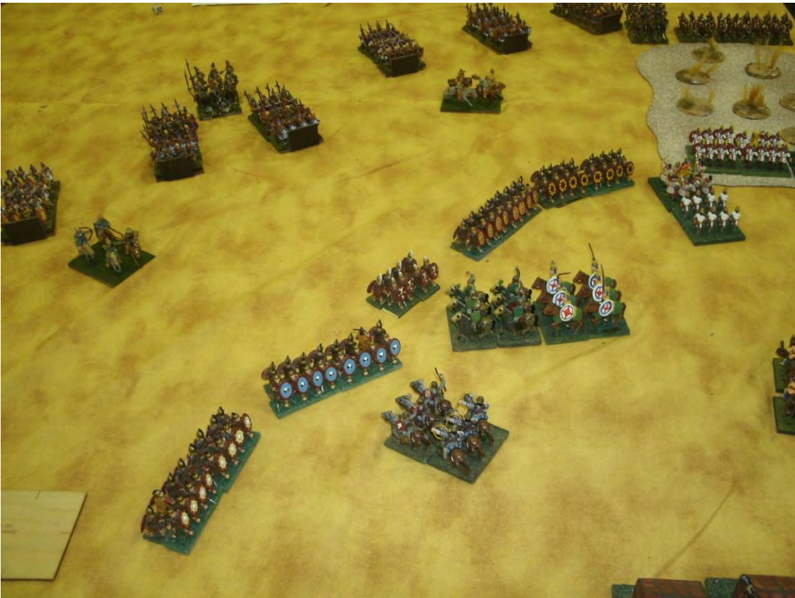
De Bellis Antiquitates (DBA) Ran Most Of The Convention