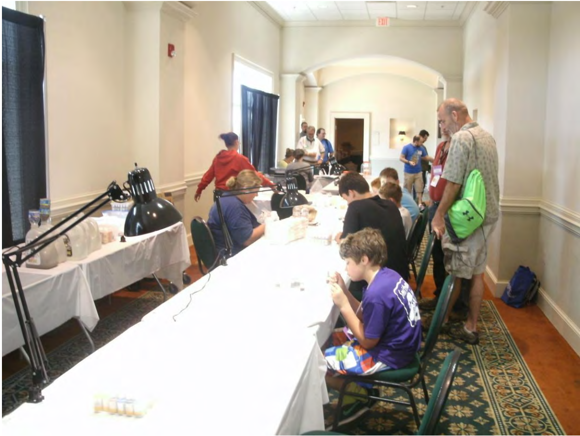
The Following Day Perhaps The Largest Miniature Hobby University Began With Six And A Half Pages of Listings In The Program