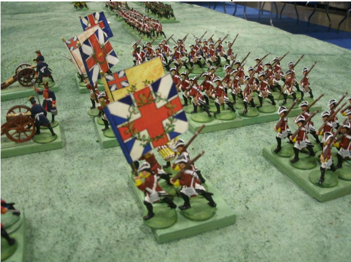
This Time It Was AMR By a New GM On Thursday Night