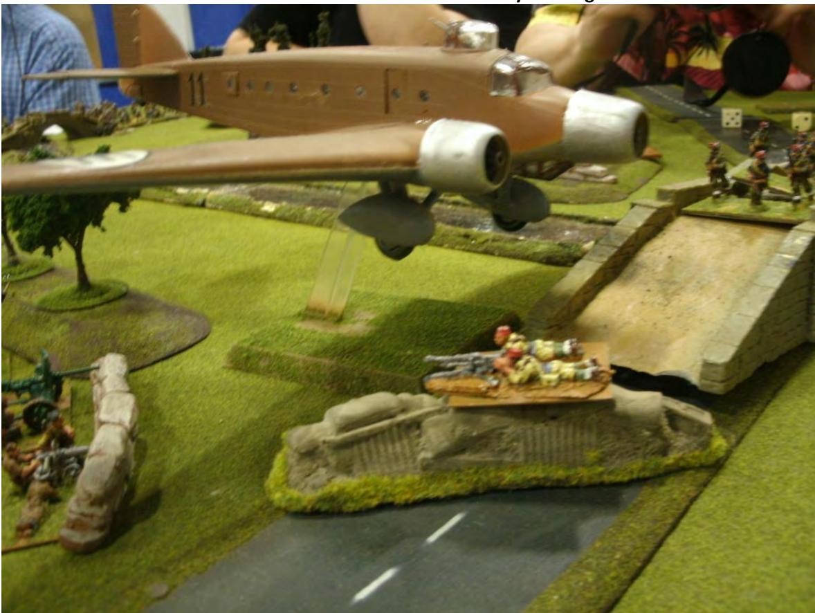
For A Change I Got A Full House For My Jarama 1937 Game!